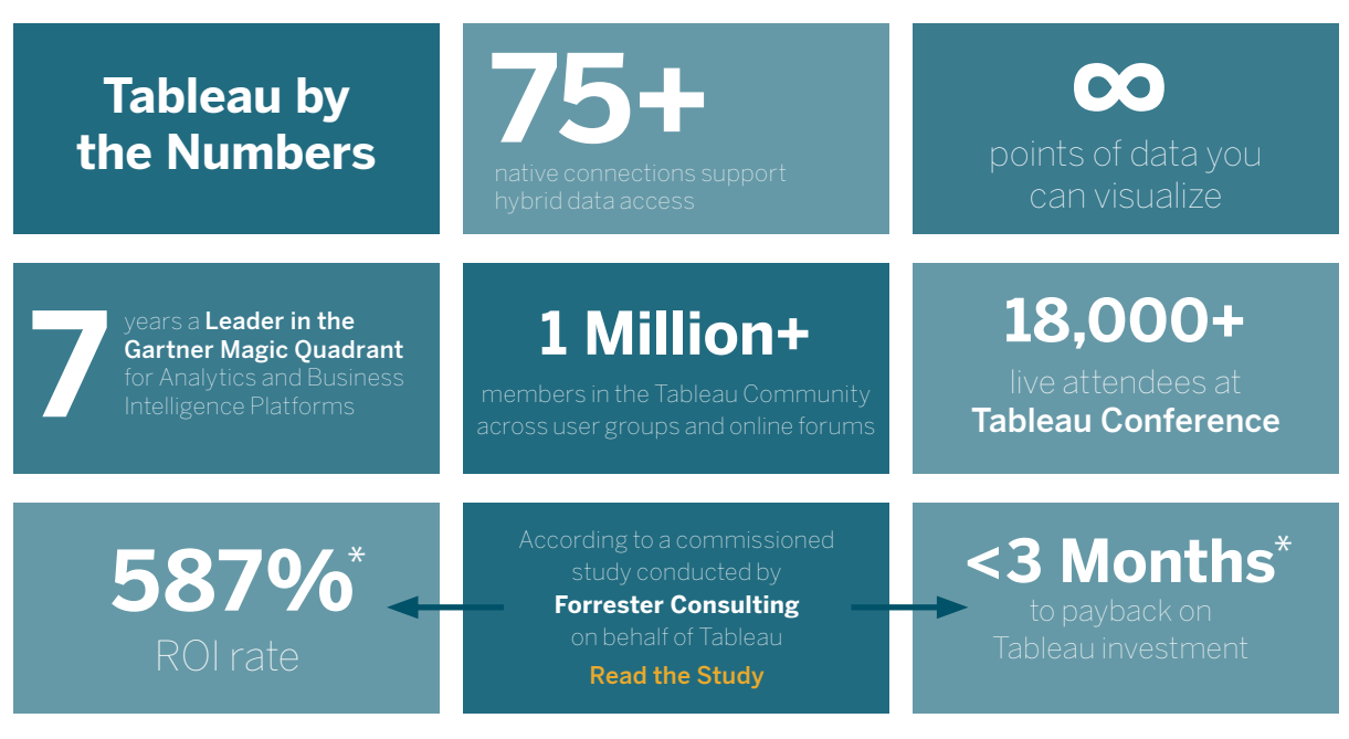
Tableau is the market-leading choice in modern business intelligence platforms, offering the greatest analytical breadth, depth, and flexibility. Everything we do is driven by our mission to help people see and understand data. Our platform is simple to deploy and scale, and as intuitive to learn as it is powerful, helping individuals and organizations get insights and value fast.

BI and analytics providers may make similar claims about features, and the end visualizations may even look the same. However, there's more value to your organization through the deeper insights users get when empowered to ask and answer their own questions.